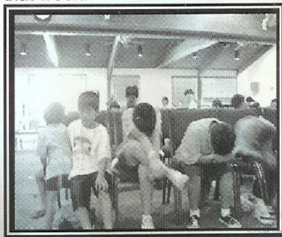
Kids from New Hope International Church praying.

One young camper shared how he had heard God talking about the spread of the gospel worldwide, that His Word would reach every nation. Several other campers and junior leaders clearly heard from God during that week.