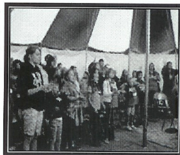
Kids singing inside the Meeting Tent