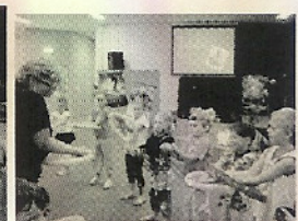
Holiday Program ballooning in 3Ci in Emerald, Qlds