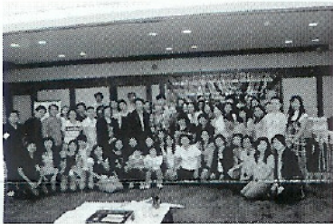
Hope Church delegates.