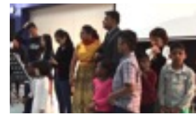
NEW LIFE CHURCH MELBOURNE