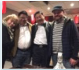
MISSIONARY PARTNERS CITYLIFE CHURCH

JEREMIAH 29:11 BRINGING HOPE AND A FUTURE