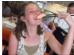
MENTORING YOUTH IN AUSTRALIA